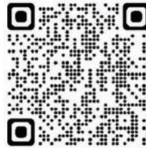
Scan to learn more

Please give generously to support this important initiative